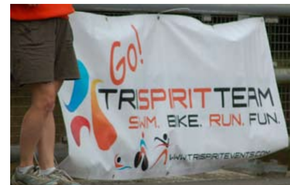
Whose knees are these? Tri Spirit set up camp at Appledore Bridge